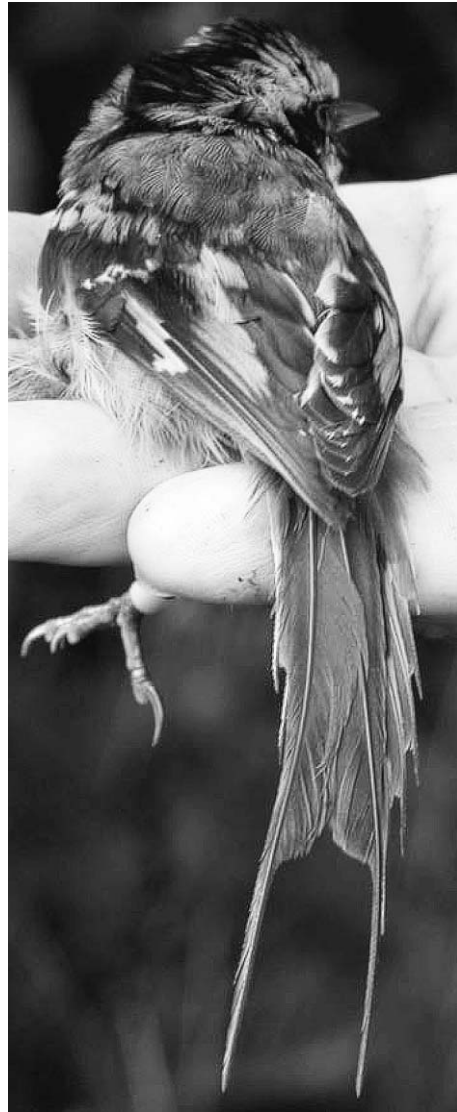
FIGURE 1. Thorn-tailed Rayadito with its characteristic graduated tail.

Switzerland) spring balance to the nearest 0.1 g. As all individuals were captured in the same nesting stage, it was not necessary to control for stage-dependent mass changes. A drop of blood was obtained by brachial venipuncture, and blood was stored in a buffer solution (100 mM of Trishydroxymethylaminomethane [TRIS] pH = 8.0, 100 mM of Ethylenediaminetetraacetic acid [EDTA] and 2% Sodium Dodecyl Sulfate [SDS]) for DNA preservation until analysis. The exact age was known for only